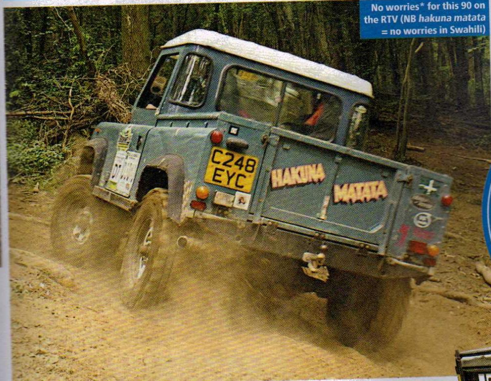
No worries* for this 90 on the RTV (NB hakuna matata = no worries in Swahili)