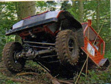
A tight CCVT one-gate caught several teams out