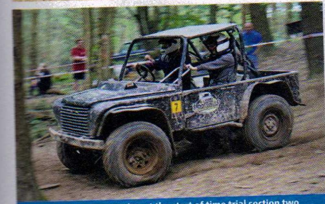
The adrenalin was pumping at the start of time trial section two

'Some of the trials sections were brilliant – proper brain teasers. A real credit to the designers'