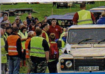
Not an outdoor rave but a marshals' briefing